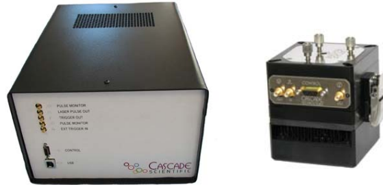
Aesthetic design subject to change without prior notice