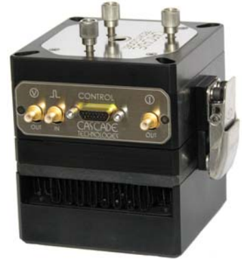
Aesthetic design subject to change without prior notice

The Cascade Laser Module houses the hermetically sealed laser package. The module can be supplied with either a forced air or water cooled heat sink, which ensures excellent cooling performance from the inbuilt peltier element. Design features, such as integrated pulse circuitry and enhanced RF screening, allow unprecedented levels of performance in terms of pulse stability, pulse amplitude, duty cycle and repetition rate. As an option, interchangeable Anti-Reflection coated ZnSe micro optics can be selected, giving a low aberration 4mm diameter collimated output beam.